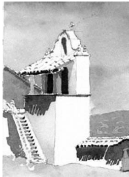
Mission La Purisima