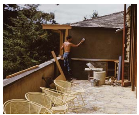
The author plastering Mrs. Wright's bedroom addition remodel at Taliesin East in 1958.

War, Wright & Gemutlichkeit: Sunday, July 21, 2013; 1-3PM; Martin Luther King, Jr. Auditorium at the Santa Monica Central Library, 601 Santa Monica Blvd., Santa Monica; free; seating is available on a first-come, first-served basis; 310.458.8600.