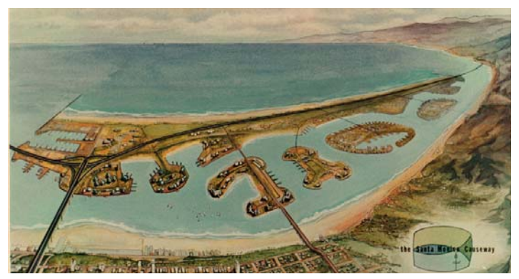
Santa Monica Offshore Freeway (1965).