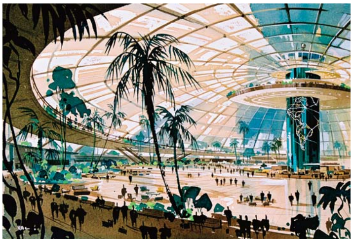
LAX original Plan by Pereira and Luckman (1952).

Never Built: Saturday, August 10, 2013; 10:30AM-12PM; A+D Museum, 6032 Wilshire Blvd., Los Angeles; $25 (includes museum admission); reservations required; see order form on Page 6, call 800.972.4722, email info@sahscc.org, or go to www.sahscc.org.