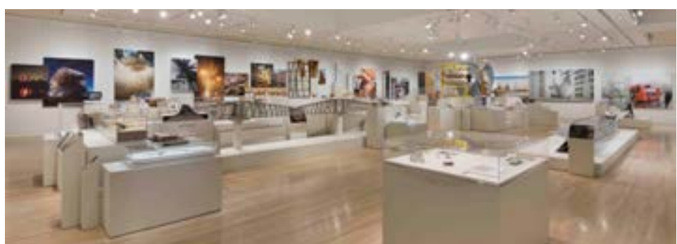
A central spine organizes the exhibition.

Delightful smiles are not always expected at an architecture exhibition (think: studied looks and squinted eyes), but at "Provocations: The Architecture and Design of Heatherwick Studio," wonder and joy pervade the exhibition and enchant its viewers. Thomas Heatherwick—the British designer known for the 2012 London Olympic Torch, UK Pavilion in Shanghai, and new Google headquarters—exudes a wonder in life, purpose, and society in a non-linear display of selected projects. Models, photographs, materials samples, over-scaled images, videos, and lifesize prototypes join with intriguing text for an immersive experience.