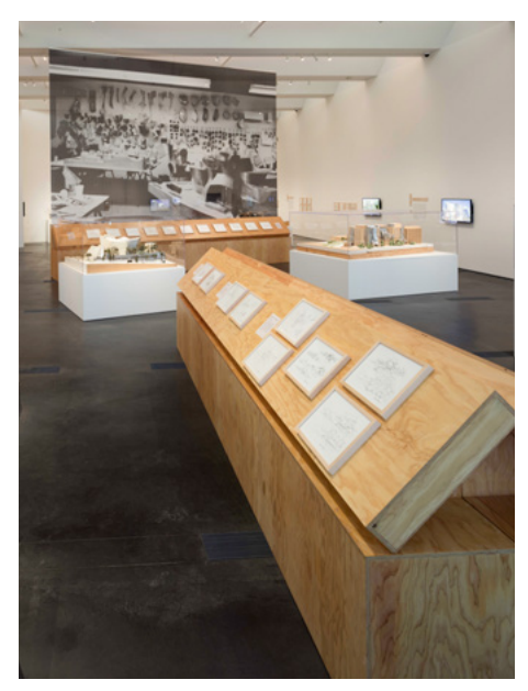
"Frank Gehry" exhibition photos at Los Angeles County Museum of Art. © 2015 Gehry Partners, LLP, Los Angeles.