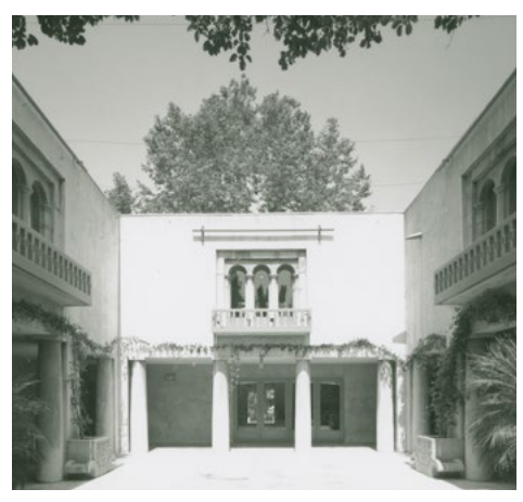
Clarke Estate (1919-21), Santa Fe Springs.