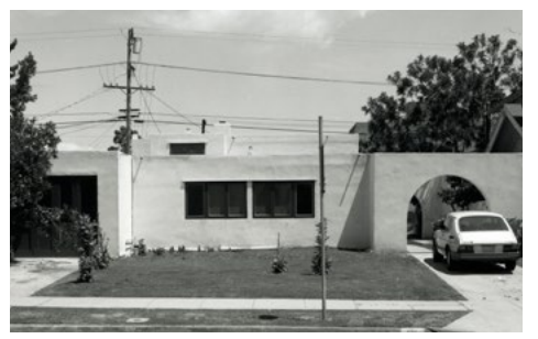
White/Morgan Residence (1917), Hollywood.