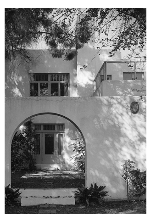
Dodge House (1916).

"the crisis of confidence between people and government, and people and real estate." She noted, "After Saturday, early Monday is the most popular time for landmark demolition. It has the obvious virtue of catching people napping, while avoiding overtime rates."