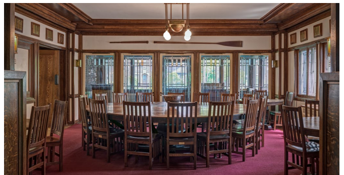
Sullivan's Bradley Residence (1908-09).

Authors on Architecture: Cannon on Sullivan—Sunday, October 13, 2024; 1-2:30 PM PST; $5; go to www.sahscc.org , and pay via PayPal or mail in order form on Page 6 with check; Zoom link sent upon registration.