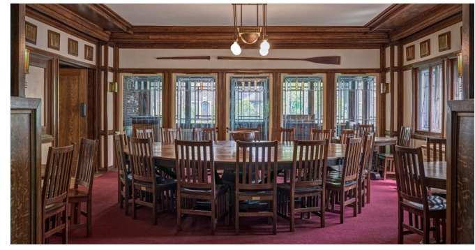
Sullivan's Bradley Residence (1908-09).

Authors on Architecture: Cannon on Sullivan—Sunday, October 13, 2024; 1-2:30 PM PST; $5; go to <a href="www.sahscc.org">www.sahscc.org</a>, and pay via PayPal or mail in order form on Page 6 with check; Zoom link sent upon registration.