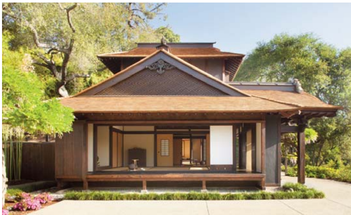
The historic Japanese House at The Huntington after renovation.

Japanese Restoration at the Huntington: Sunday, May 20, 2012; 9:30AM-12:30PM; The Huntington Library, Art Galleries, and Botanical Gardens, 1151 Oxford Road, San Marino; SAH/SCC members, $55; non-members, $100 (includes one-year individual membership); reservations required; space is limited; all orders are on a first-come, first-served basis; registration—see order form on Page 7, call 800.972.4722, or go to www.sahscc.org .