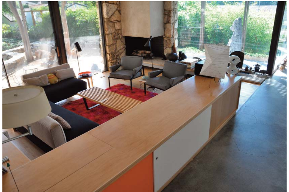
Phineas Kappe Residence, 1956.