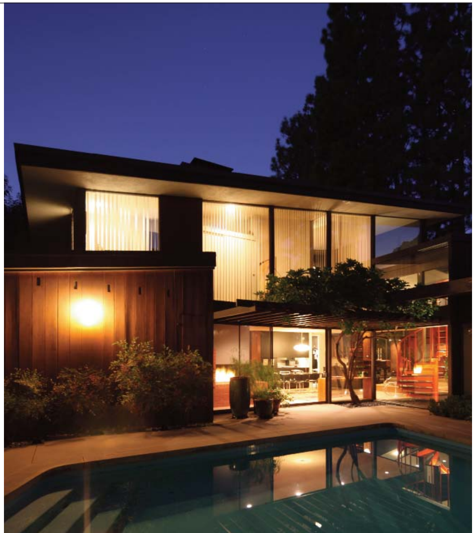
Barsha Residence, 1961.