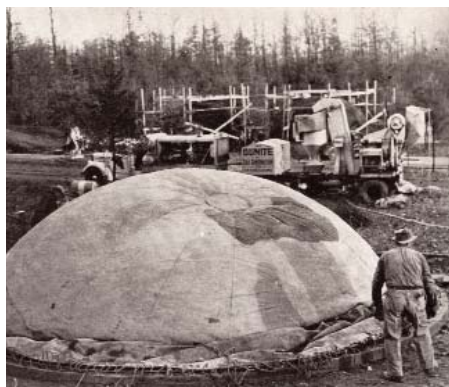
In bubble house construction, the Airform balloon is attached to the foundation while inflating.

Photo: The Huntington Library, Art Collections, and Botanical Gardens. (Princeton Architectural Press)