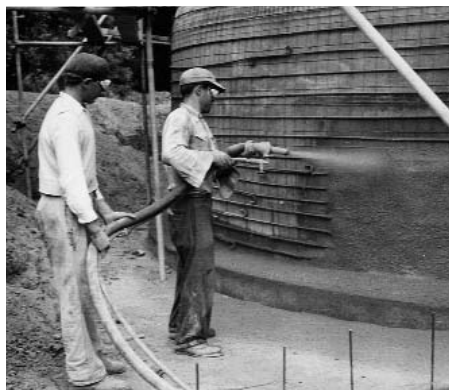
Second layer of gunite is applied to the Airform balloon for this 1958 structure created in Portugal for Port wine storage.