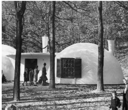
Visitors at the Falls Church, VA, bubble houses in 1942.

No Nails, No Lumber: Saturday, June 9, 2012; 1PM; Martin Luther King, Jr. Auditorium, Santa Monica Central Library, 601 Santa Monica Blvd., Santa Monica; free; seating is available on a first-come, first-served basis; 310.458.8600.