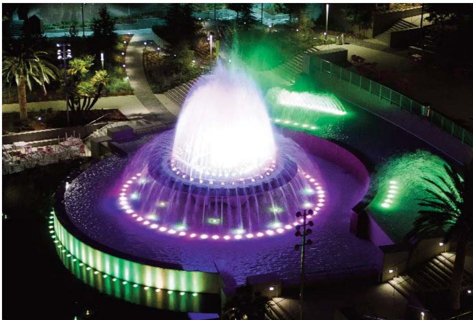
Restored historic fountain is more efficient and interactive.