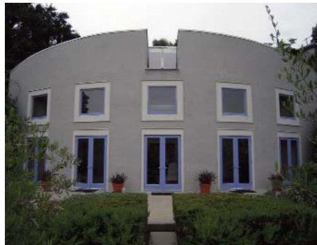
Symmetrical front façade of Moore's Rodes residence.