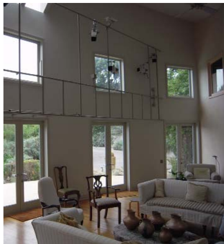
Rodes living room featuring scaffolding by Frank Gehry.

18th-Century houses in the south of France." The house has been widely published in Architectural Record , Architecture and Urbanism , and GA Houses .