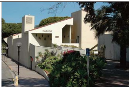
UCSB Faculty Club by Charles Moore.

Watch for SAH/SCC E-alerts and the November/December issue of SAH/SCC News for more information and the opportunity to order tickets. Since space is limited, orders will be filled on a first-come, first-served basis.