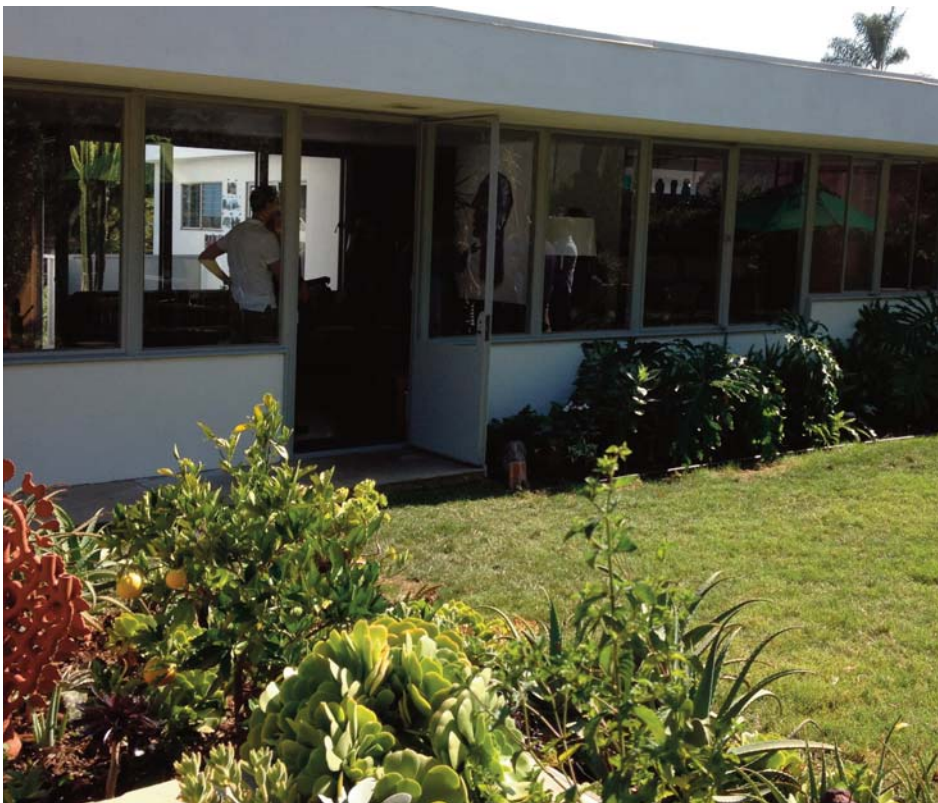
Back façade of Lukens house.