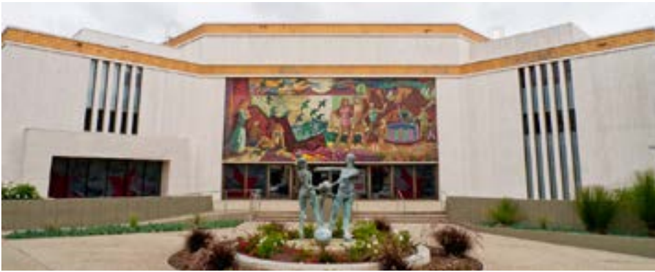
Santa Monica Home Savings (1970).