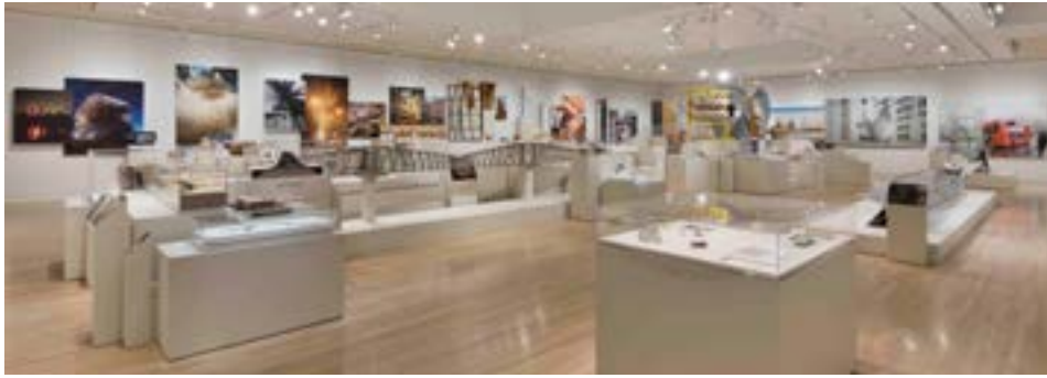
A central spine organizes the exhibition.

Delightful smiles are not always expected at an architecture exhibition (think: studied looks and squinted eyes), but at “Provocations: The Architecture and Design of Heatherwick Studio,” wonder and joy pervade the exhibition and enchant its viewers. Thomas Heatherwick—the British designer known for the 2012 London Olympic Torch, UK Pavilion in Shanghai, and new Google headquarters—exudes a wonder in life, purpose, and society in a non-linear display of selected projects. Models, photographs, materials samples, over-scaled images, videos, and life-size prototypes join with intriguing text for an immersive experience.