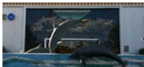
Rolling Hills/Rancho Palos Verdes Home Savings (1974).