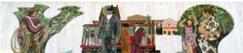
Torrance Home Savings (1979).