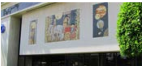
Downey Home Savings (1982). Photo: Maribeth Danko, 2012; used with permission.