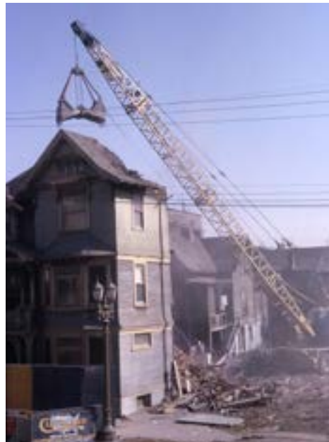
Demolition of 310 South Grand Avenue, near where the Omni Los Angeles Hotel is now.

Authors on Architecture: Marsak on Bunker Hill—Saturday, November 14, 2020; 1-2:30PM Pacific; $5; reservations required—see order form on Page 6 or go to www.sahscc.org ; Zoom connection information sent upon registration.