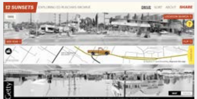
A screenshot of 12 Sunsets, which features photos from the Streets of Los Angeles Archive. The Getty Research Institute, 2012.M.1. © Ed Ruscha. Website design by Stamen.

The Getty Research Institute launched 12 Sunsets: Exploring Ed Ruscha's Archive , an interactive website that allows users to digitally maneuver a yellow pickup truck—presumably the type Ruscha attached a motorized camera to—to "drive" down Sunset Boulevard in 12 different years the artist photographed the boulevard between 1965 and 2007. They can also view, search, and compare more than 65,000 photographs from the Ed Ruscha Streets of Los Angeles Archive, a trove of 500,000 photographs, notes, drawings, and records documenting the artist's photography of L.A. Search functions include address, text, year, or subject; there's even a stipulation for what should not be seen in photos (no cranes, please!). Comparing several years at a time starkly shows how most things change—not usually for the good.