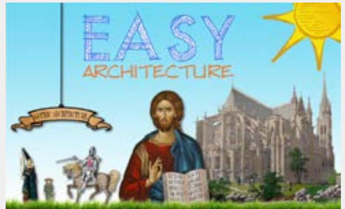
Title slide for "Easy Architecture" pilot episode on Gothic Architecture.